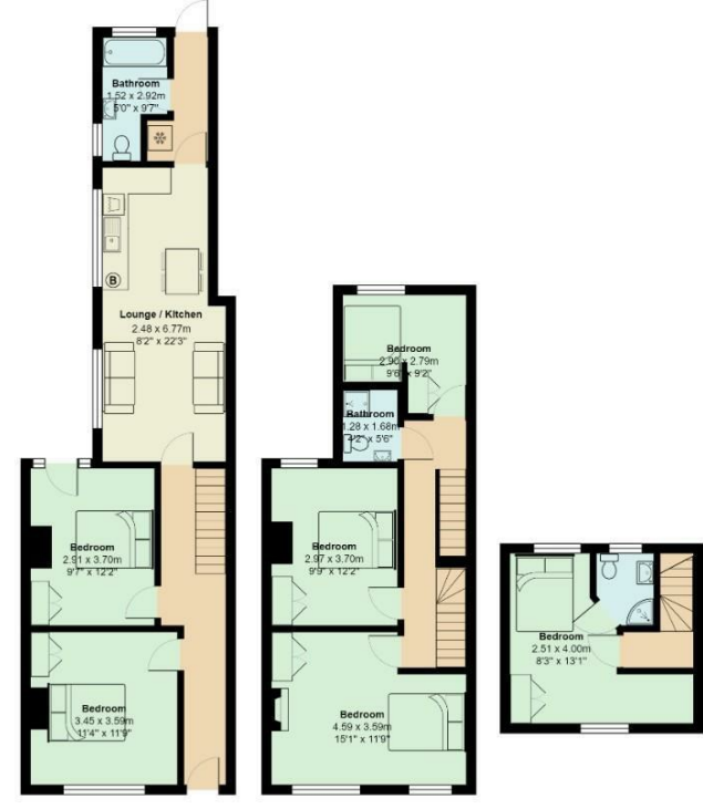
Mundy Place, Cathays

Total Area: 124.3 m 2 ... 1338 ft 2 All measurements are approximate and for display purposes only.